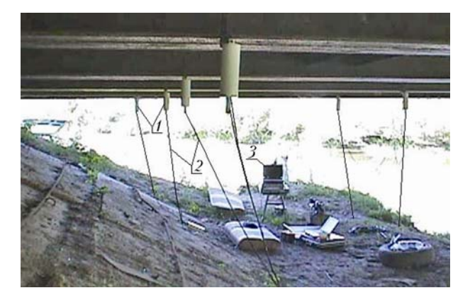
Fig. 5. Arrangement of the «Phase» system under the bridge span: 1 the acoustic sensors; 2 the tension members; 3 the notebook.

and air flow displacement on measuring results.<sup>30</sup> The sensors are arranged at tension members so that the acoustic radiator is rigidly attached to the construction and the receiver - to the ground (Fig. 5).