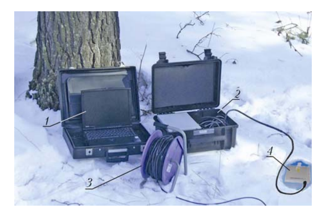
Fig. 4. Multichannel recorder MGR-01 at field tests: 1 is the notebook for fixation of results; 2 is the packing case with recording unit; 3 is the supply cable coil; 4 is the external antenna unit.

To record these pulses, the multichannel geophysical recorder MGR-01 was constructed. It represents a set of sensors of NPEMEF electric and magnetic components joined into the antenna unit and recording unit (Fig. 4).