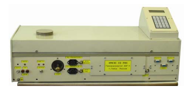
Fig. 2. External view of the gas analyzer DOG-4 for control the concentration of emissions of NO and SO_2 .

The test prototype of the gas analyzer operating in the IR range is made for control the carbon monoxide content in smoke emissions.<sup>25</sup>