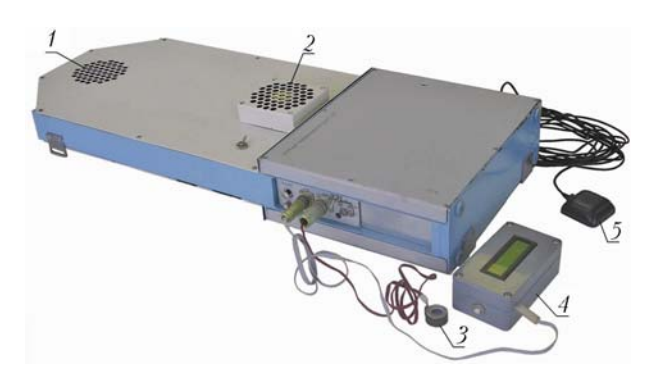
Fig. 3. External view of a gas analyzer DOG-05: 1 are the holes for air intake pumped through the multi-pass optical basin; 2 are the outlet holes; 3 is the standard cell with controlled temperature; 4 is the external unit of control and indication; 5 is the antenna of the GPS-receiver.

air at trace surveys and at mercury monitoring of peatbog systems.