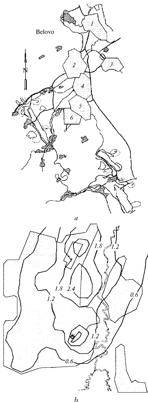
Fig. 1. Sectorization of the air basin of the Belovo urban area: (a) schematic map of relative locations of the ecological sectors: Gramoteino (1), Central (2), Inskii (3), Babanakovo (4), Chertinskii (5), and Novyi Gorodok (6); (b) sample map of pollution of the air basin of the Central sector (averaged over one year, the figures labeling the isocontours indicate the concentration of suspended particles in \text{mg}/\text{m}^3 ).

results of an analysis of snow samples for content of the dangerous toxic substance benz(a)pyrene.