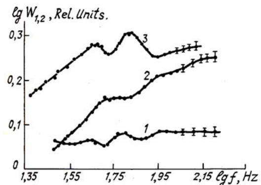
Fig. 2. The frequency dependence of the ratio of two fluctuation power spectra under the following sounding conditions:

Figure 2 presents the experimentally derived ratio \log W_{1,2} = \log(W_1/W_2) , plotted for convenience of comparison of the spectra W_1(f) and W_2(f) on a log-log scale. The distinctive feature of the behavior of \log W_{1,2} is that it is decidedly nonmonotonic.