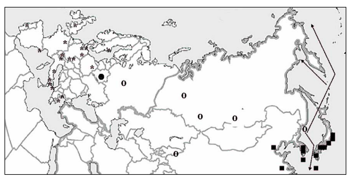
Fig. 1. Lidar networks on Eurasian continent: EARLINET (*), CIS-LiNet ( \mathbf{0} ), and AD-Net ( \mathbf{\square} ).